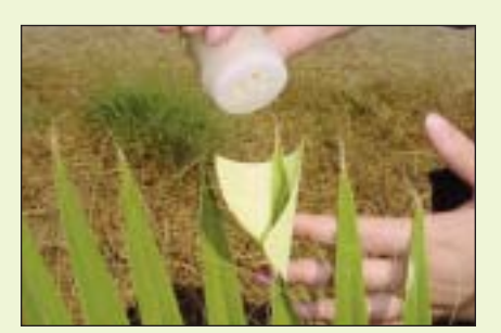
Post-it makes release platform for predator mites.