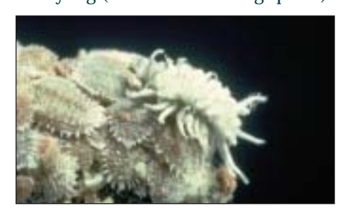
Cryptolaemus larva feeding on citrus mealybug.

Mealybug Destroyer: The lady beetle Cryptolaemus montrouzieri is effective when mealybug numbers are high and conditions are warm and humid and days longer. Several releases may be necessary, particularly during winter. "Crypts" may be drawn to a strong light from a skylight or picture window. In such situations, release after dark so the beetles find food and get settled before the bright sun attracts them to the window. They are less effective on longtailed mealybug (Pseudococcus longispinus).